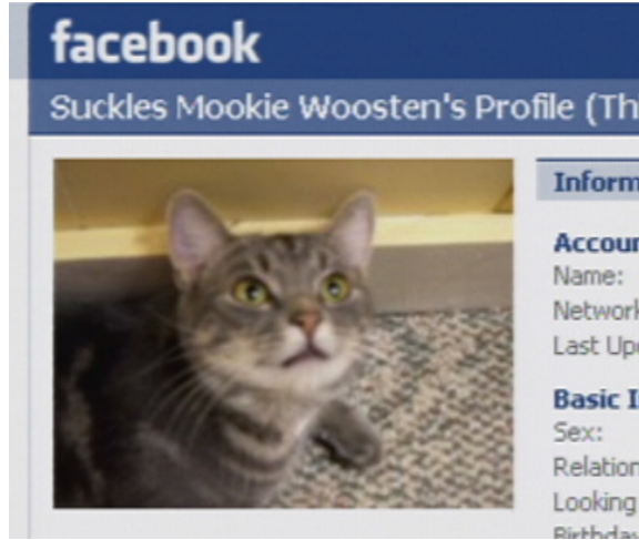
What a pussy, posting a picture of his cat on his facebook. Lame-o...